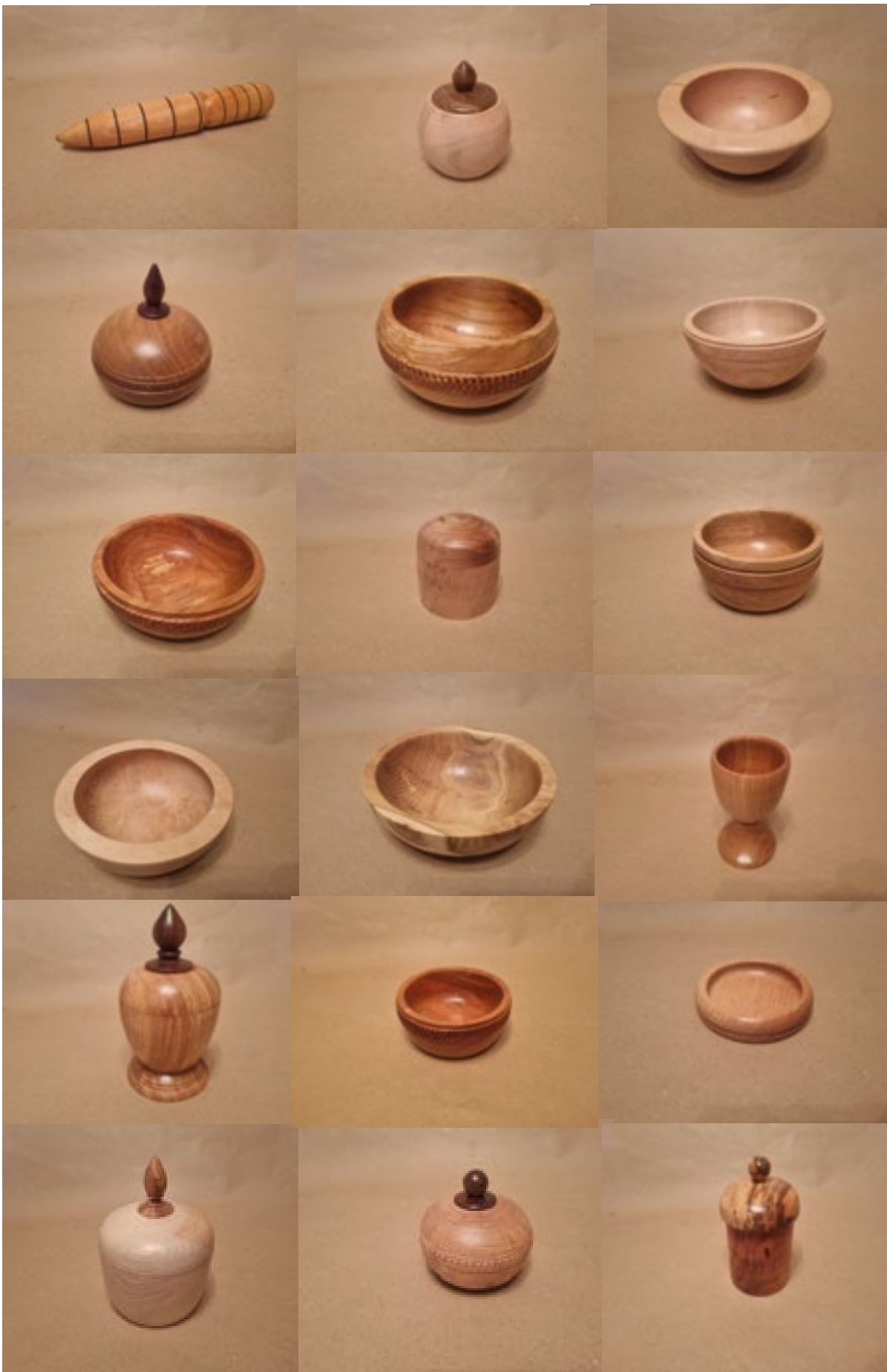
Above and below: Malcolm Kerr – 21 items for Weird and Wonderful Wood show club stand tombola