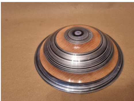
Paul Askew - Coloured shield